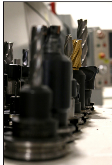
Drill bits used in the machining process.

"I have a tendency to hyper focus on a project or job. The Air Force has given me the opportunity to work and buy my own equipment and translate what I do here to my home so I can start working out of my own shop and turn it into a profitable business. That is just ideal."