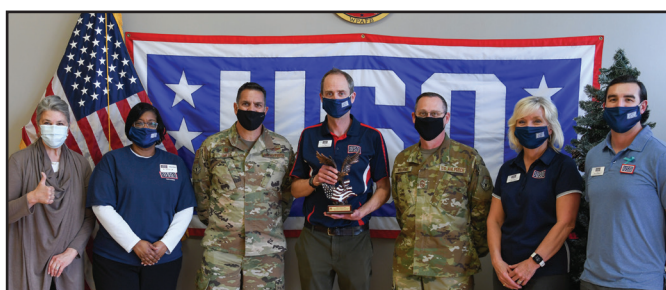
Wright Patterson USO